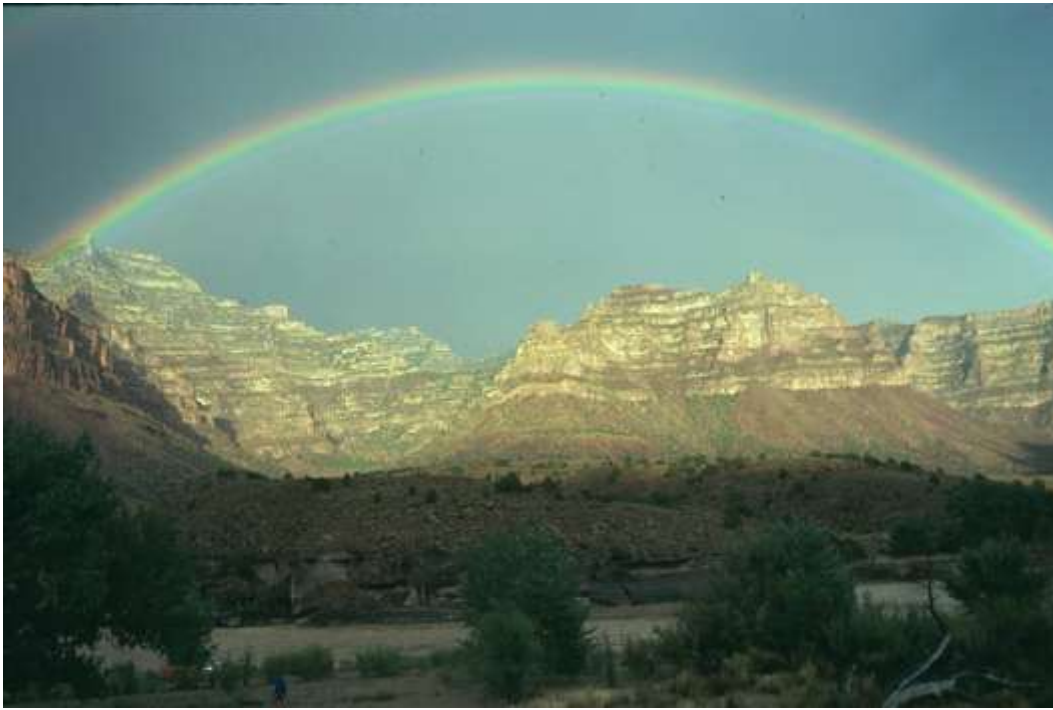
Desolation Canyon at Trail Canyon