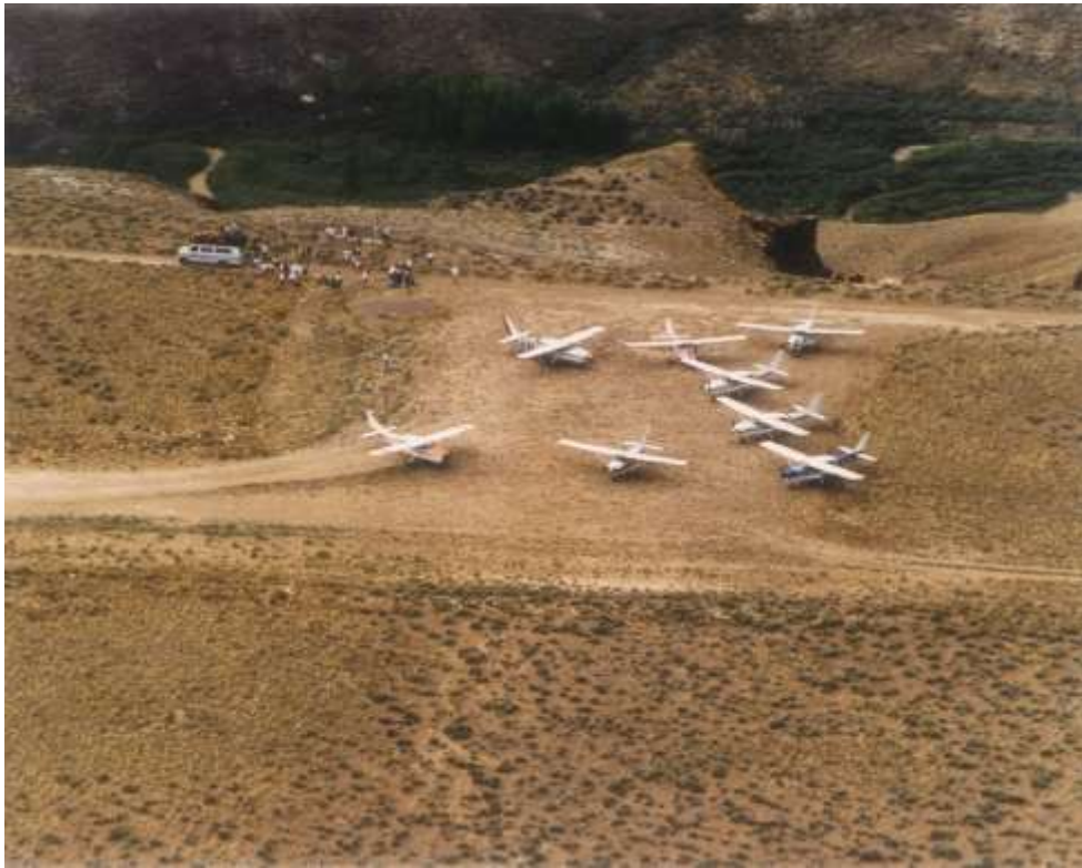
Sand Wash Airstrip. Many users fly to Sand Wash in chartered aircraft. This service typically costs $150 per person.