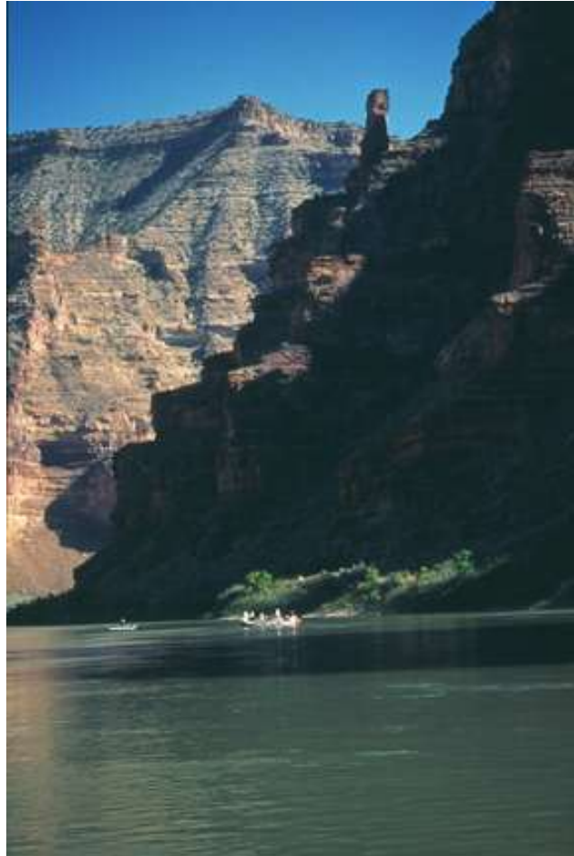
Powell's Lighthouse Rock

The Desolation Canyon Special Recreation Management Area (SRMA) was established in the Price River Management Framework Plan of 1983. The SRMA extends from Sand Wash to Swaseys Boat Ramp and includes lands within two miles of the river.