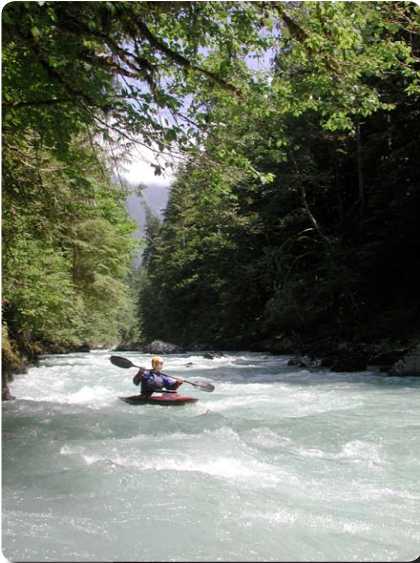
Jessica Sneedon on the North Fork Nooksack Canyon.

“The North Cascades is rad because of how undeveloped it is. It is a treat to be able to achieve a semi-wilderness experience amidst big mountains, awesome wildlife, clean water, and minimal human impact... all within an hour or two from the cities of western Washington. While the infrastructure is there to get us *close* to rivers, and to get drivers to some pretty amazing spots, I appreciate that there aren't roads and attractions everywhere we might want to go.” - Ethan S.