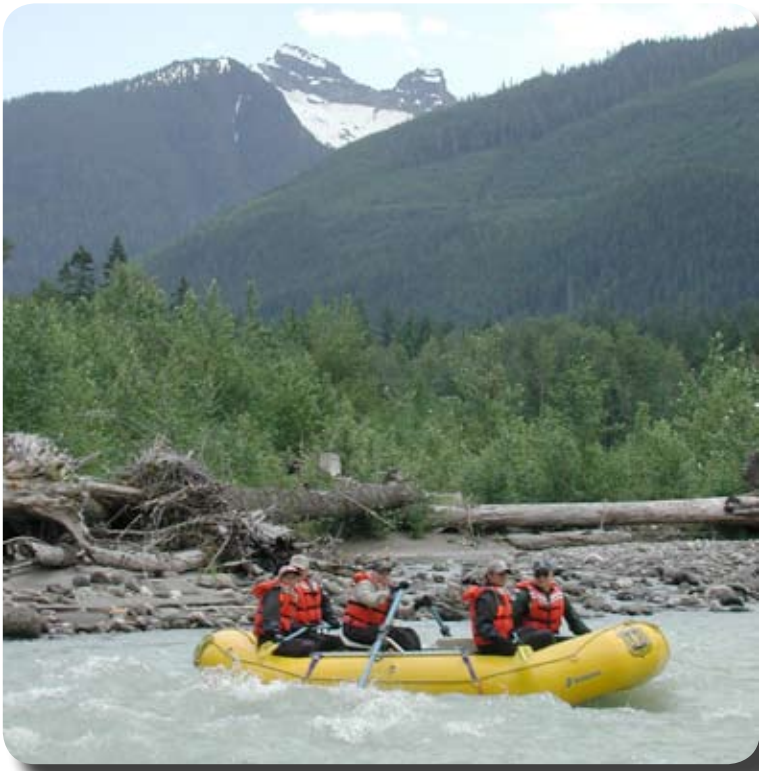
Forest Service staff out on the Suiattle Wild and Scenic River.